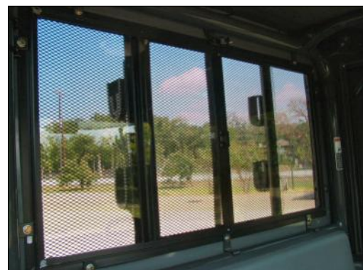
Our Rear Glass Window slides open 20" for four way circulation.