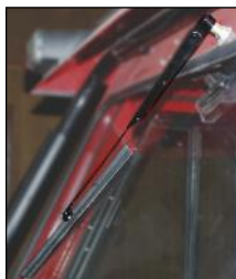
All Cabs include: Dome light, An accessory wiring harness with fuse panel; and an electric windshield wiper.