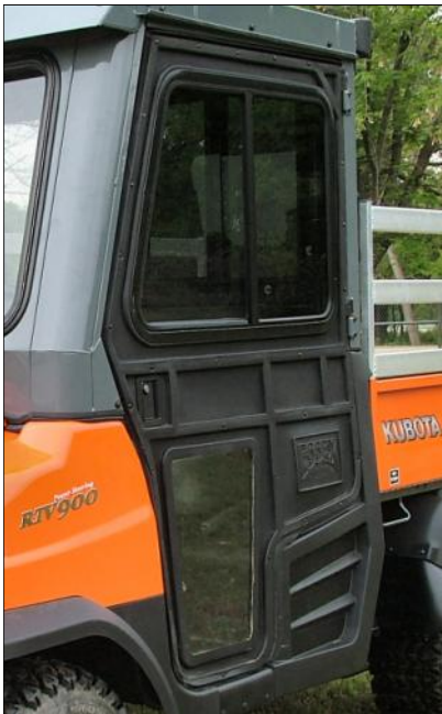
The steel Reinforced Vinyl Doors are molded to fit the door opening. Light but durable, they feature lift off hinges for easy removal and storage.

The Essex Hardtop and Safety Glass Lift Windshield are the foundation for the modular cab system. The Hardtop features a preinstalled wiring harness, dome light and headliner.